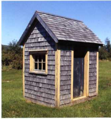
24 Centrefold Utilitarian Beauty, The Lowly Outhouse