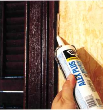
22 Paint By The Numbers The Finishing Touch, Seamless Seams