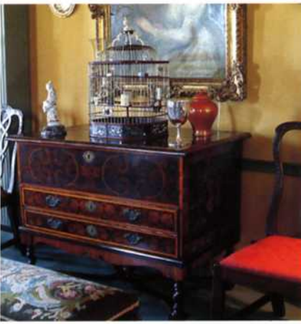
6 Circa 1764 For Lovers Of All Things Georgian