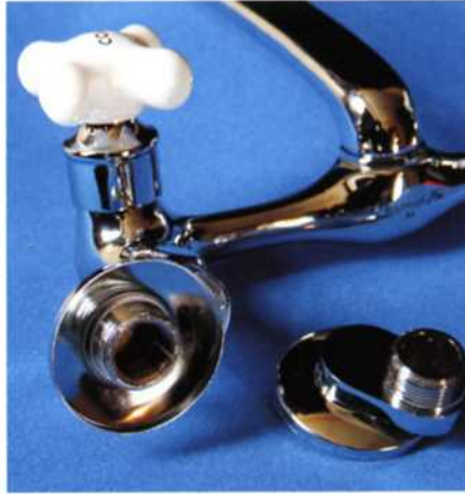
35 Waterworks 14 Making A Sink Faucet Work