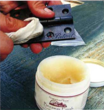
32 Restoration Brief Four Restoring Cast Hinges, Burn Refinish Technique