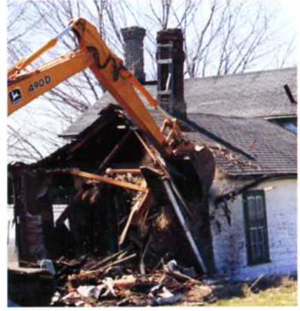
26 Abandoned Canada A New Life For A Razed House