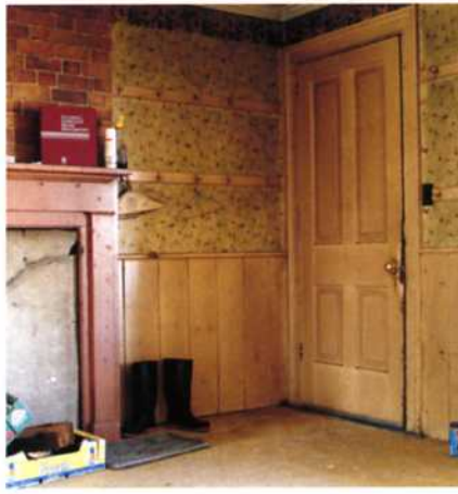
10 Tradition A Conversation With Restoration Purists