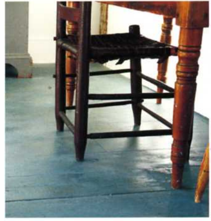
16 Feature Restoring Historic Wooden Floors