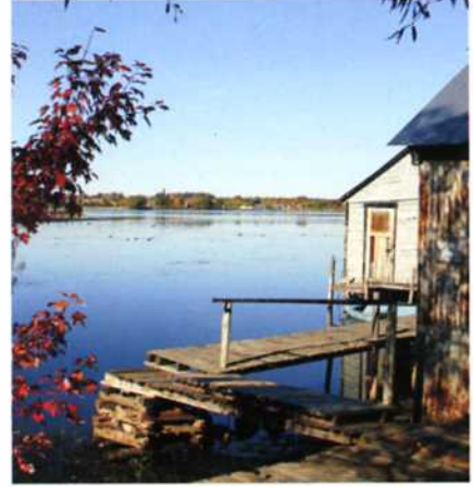
36 Cooper's Canada A Road Trip To Barriefield, Ontario